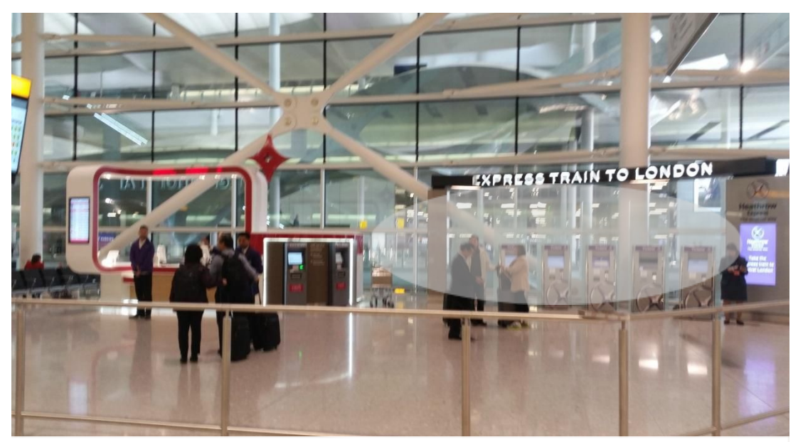
View upon arriving into Terminal 2 and the location of your driver.

Once you leave the baggage collection area after a short walk, you will enter the arrivals hall. Once there, your Airport Lynx chauffeur will meet you by the "Express trains to London" sign which is in front of you as you enter the arrivals hall and is next to the Travelex.